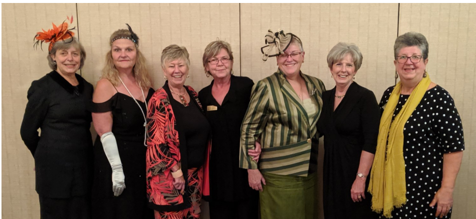
Zonta Hamilton 1 members at the D4 Conference in Buffalo September 28, 2019

Empowering Women Through Service and Advocacy