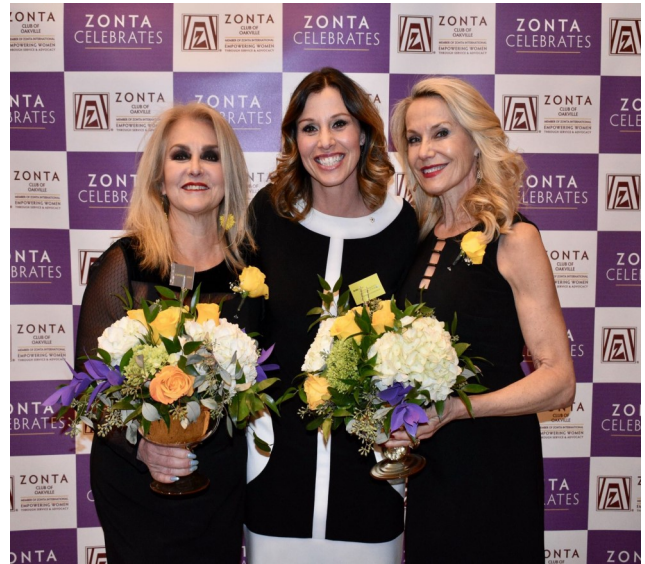
"The Wine Ladies" MCs of the event and Catriona LeMay Doan

Zonta Club of St. Catharines is having An English Afternoon Tea and Lucky Number Draw Sunday, April 28 th , 2019 @ Rockway Vineyard Golf 3290 Ninth St., St. Catherine's Cost $35.00