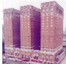
Statler where Zonta was founded