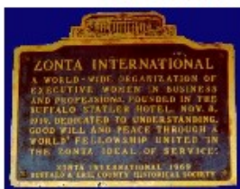
Plaque on Statler Building

CELEBRATE ZONTA'S 100TH ANNIVERSARY GALA DINNER AT STATLER FRIDAY EVENING