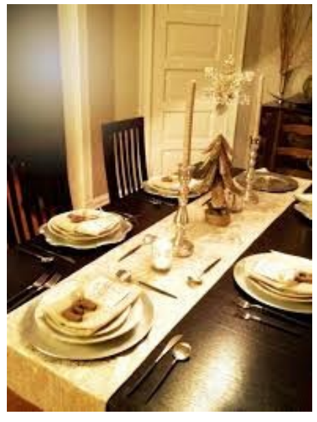
July 4th – 4th of July Party