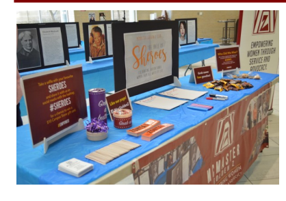
The McMaster Golden Z Club organized the Sheroes display at the Student Centre on March 5th, 2018.