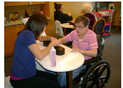
Ladies from Macassa Lodge enjoying their manicure tables!