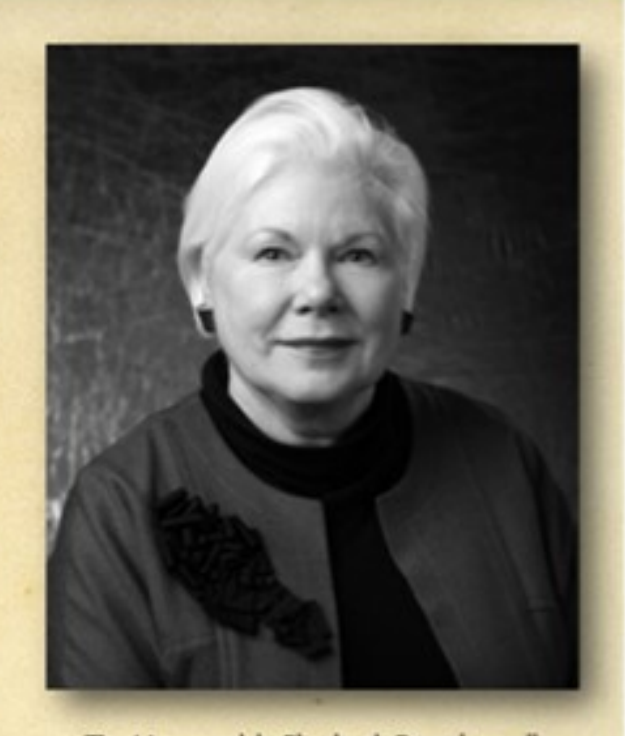
The Honourable Elizabeth Dowdeswell

Aurchase lickels on-line al www.sonlaniagarafalls.ca or call 289–241–3422.